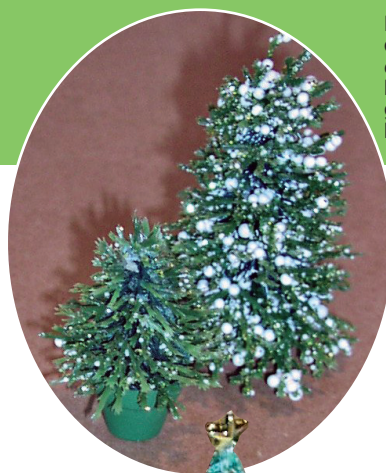
Left: Older children might enjoy the challenge of adding glitter-covered holiday greens.

For older or more experienced children, add glittered holiday faux decorative branches in red, gold, white or silver