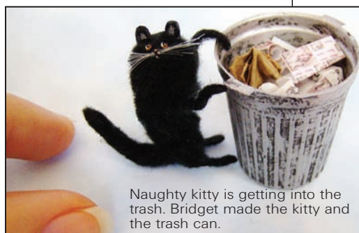
Naughty kitty is getting into the trash. Bridget made the kitty and the trash can.

Here is an easy way to convert dairy creamers into dollhouse scale (1" or ½" scale) trash receptacles. Follow these instructions, and in ½-inch scale, it's a trash can. Paint it differently and put it beside a desk as a 1-inch scale wastepaper basket. This project is fun and easy for adults and kids. Children may need adult supervision with cutting the rim.